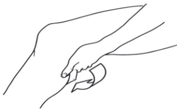
Figure 3. Spread PENNSAID ® evenly on the back of your knee

Step 4. Repeat steps 2 and 3 for the other knee if needed.