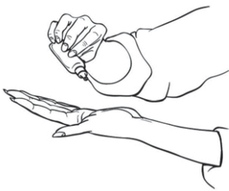
Figure 1. Dispense 10 drops of PENNSAID ® at a time

Step 2. Your total dose for each knee is 40 drops of PENNSAID ® . You will use 10 drops at a time. Put 10 drops of PENNSAID ® either on your hand or directly on your knee.